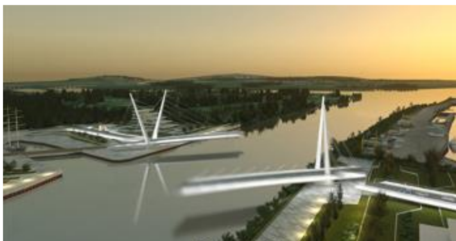
Clyde Waterfront and Renfrew Riverside Project