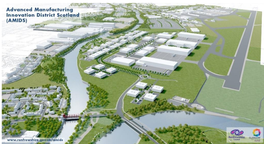
Glasgow Airport Investment Area Project

In Renfrew traffic flows will change particularly in the vicinity of the new Clyde Crossing. Flows on King's Inch Road will increase but this is from a relatively low base while there will be reductions in congestion around Renfrew Town Centre and Inchinnan Road, as the new Renfrew Northern Development Road allows for an alternative route around the Renfrew Cross junction.