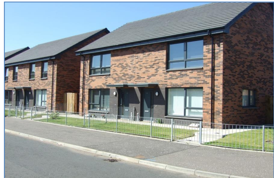
Shortroods, Paisley, Sanctuary Scotland, completed 2015/16

This Strategic Housing Investment Plan includes ambitions plans to deliver around 450 new Council homes over the next five years throughout the Paisley, Johnstone and Bishopston areas.