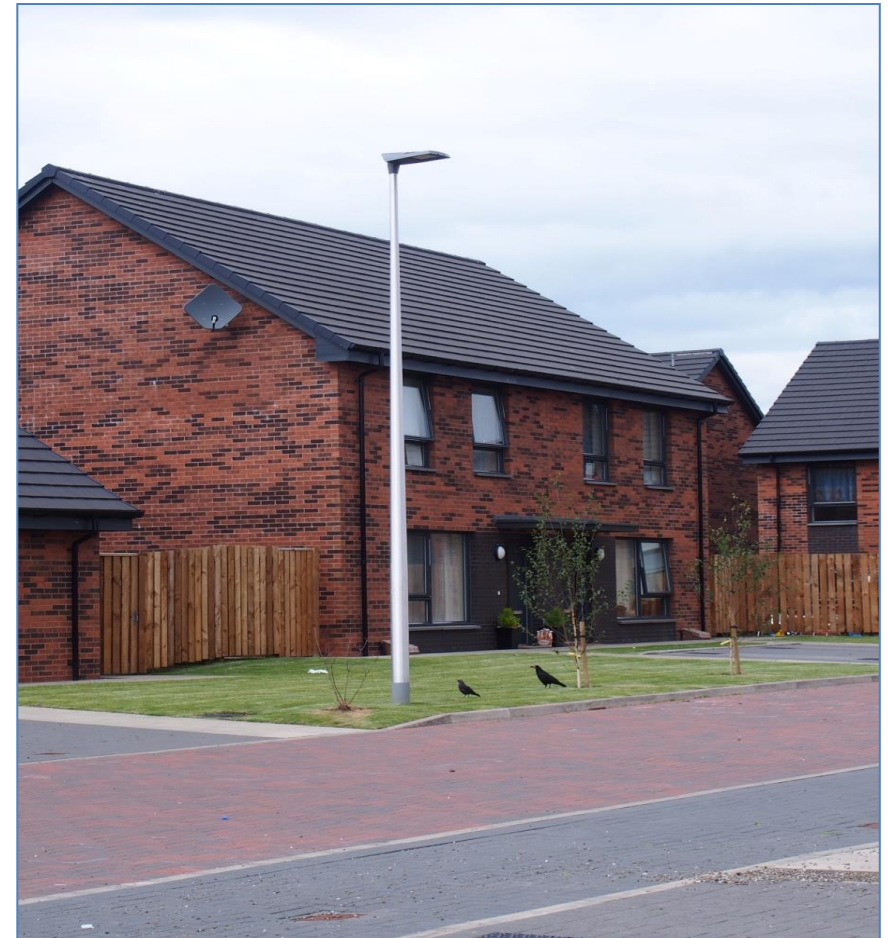
Shortroods, Paisley, Sanctuary Scotland Housing Association