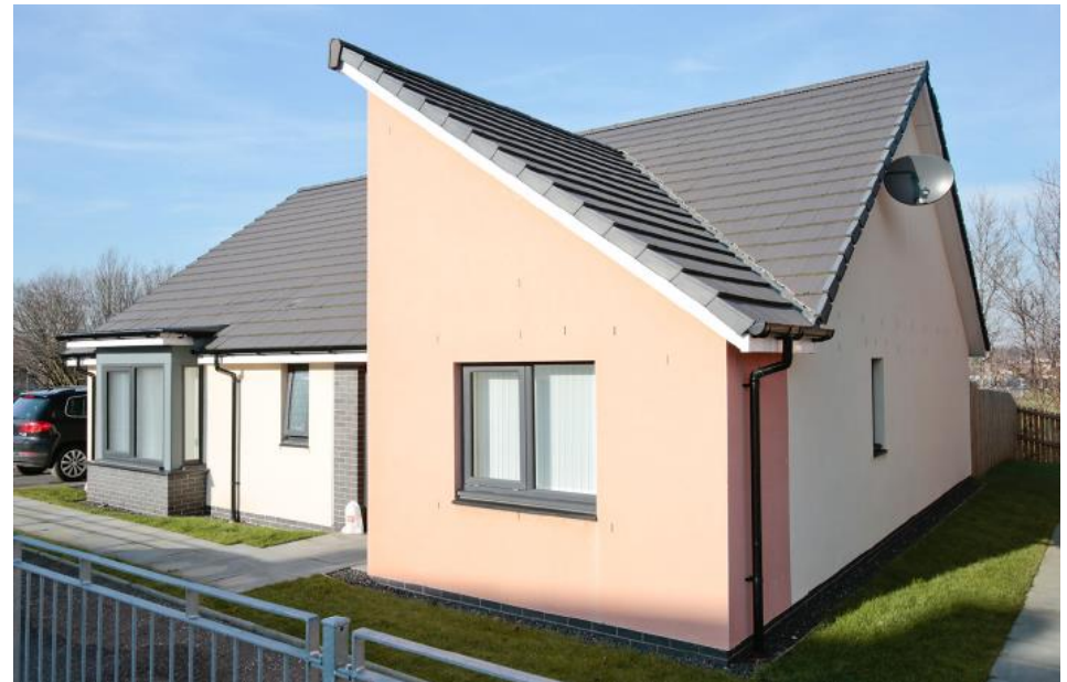
Wheelchair Bungalow, Link Housing Development, Tannahill Crescent, Johnstone

A Design Guide is currently under development to assist affordable housing developers in the provision of both general needs and wheelchair accessible housing. This should be available by the start of 2019 and will promote the development of wheelchair accessible homes across suitable affordable housing sites.