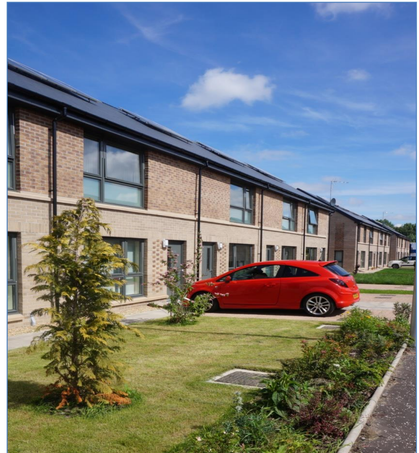
Andrew Avenue Phase 1, Renfrew, Sanctuary Scotland

The Scottish Government's Affordable Housing Supply Programme sets out a framework to deliver local housing projects and priorities to assist in achieving the 'More Homes Scotland' 50,000 affordable homes target during the life of the current Parliament. (A diagram of the process is shown in Appendix 1)