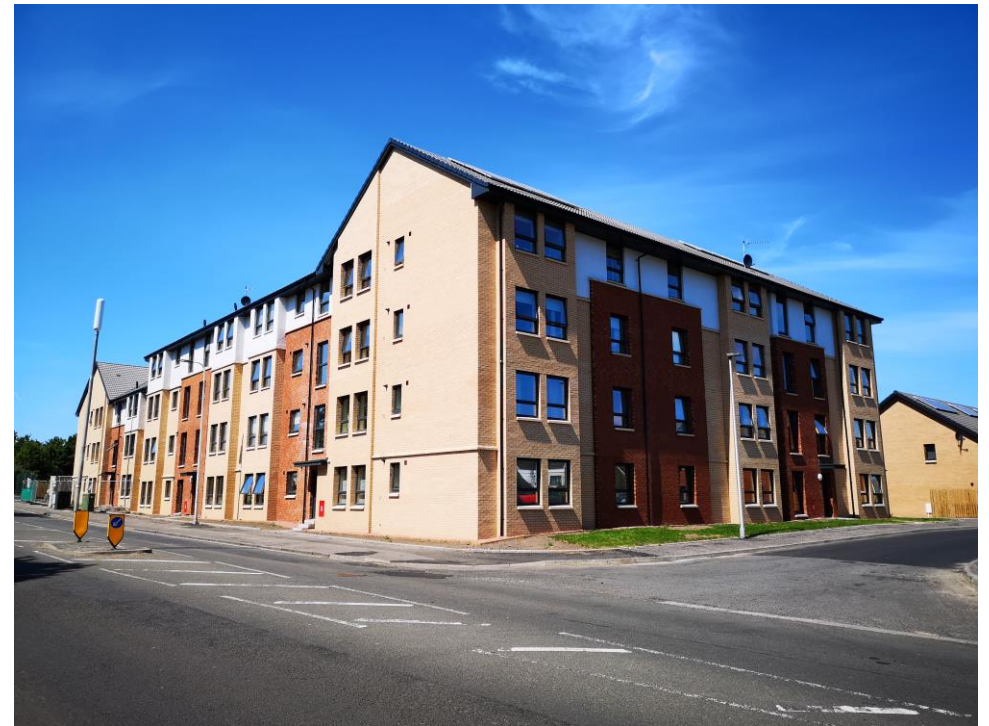
Western Park, Renfrew, Sanctuary Scotland

Following the consultation, an updated and ambitious development programme has been formed that will deliver affordable homes for a range of different needs groups across Renfrewshire. The proposed development programme is included at Appendix 3.