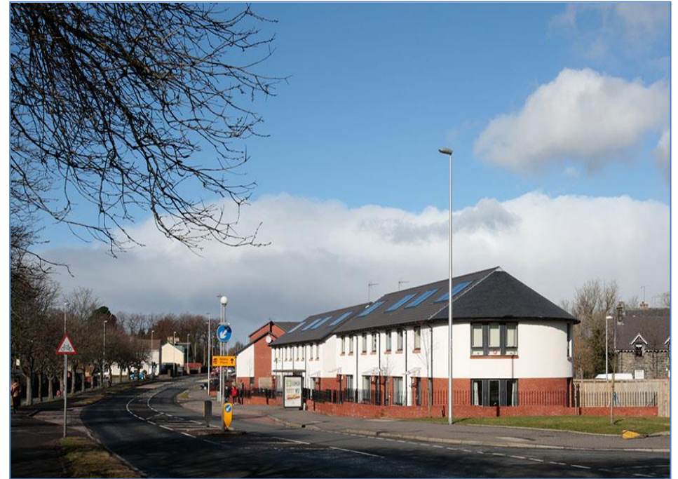
Barrhead Road, Paisley, Renfrewshire Council Development

As noted earlier, this Strategic Housing Investment Plan includes both a 'core' and 'shadow' programme. Projects within the 'core' element of the programme will be progressed in specific years with available Scottish Government grant funding used in these years to progress these projects. Projects included in the 'shadow' programme will be progressed as funding becomes available either through additional funding allocations from the Scottish Government or through the exploration of opportunities with partners in terms of front-funding development.