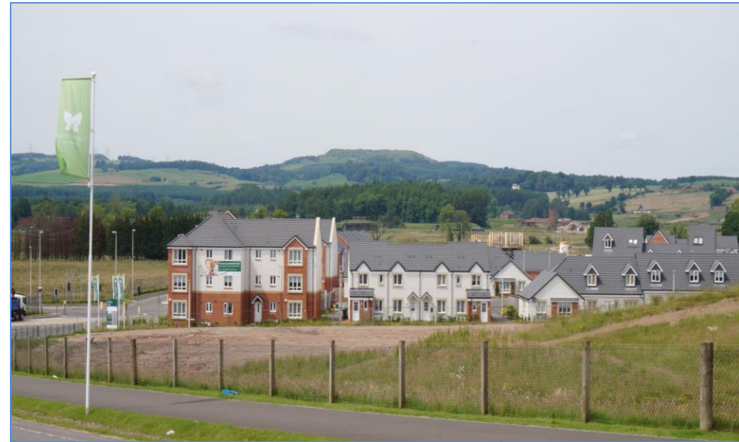
Dargavel Village, Bishopton

Moving forward, we will continue to try and identify potential sites for affordable housing provision in both North and West Renfrewshire to help meet affordable housing need in these areas.