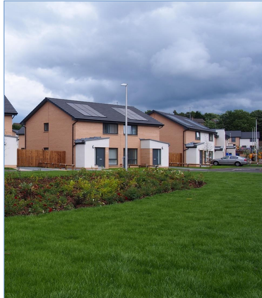
Thrushcraigs Crescent, Paisley, Link Group

Projects within this Strategic Housing Investment Plan have been prioritised to reflect project deliverability in terms of local needs assessments, site availability, strategic priorities and funding availability from both a programme perspective and the housing developers' own financial capacity.