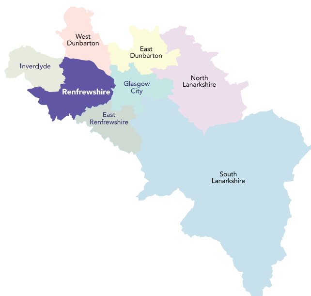
Map of the 8 Local Authorities within the Clydeplan area