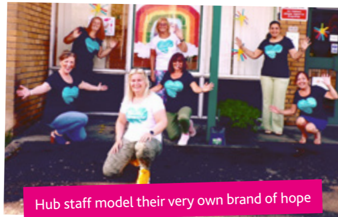
Hub staff model their very own brand of hope