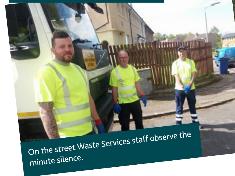
On the street Waste Services staff observe the minute silence.