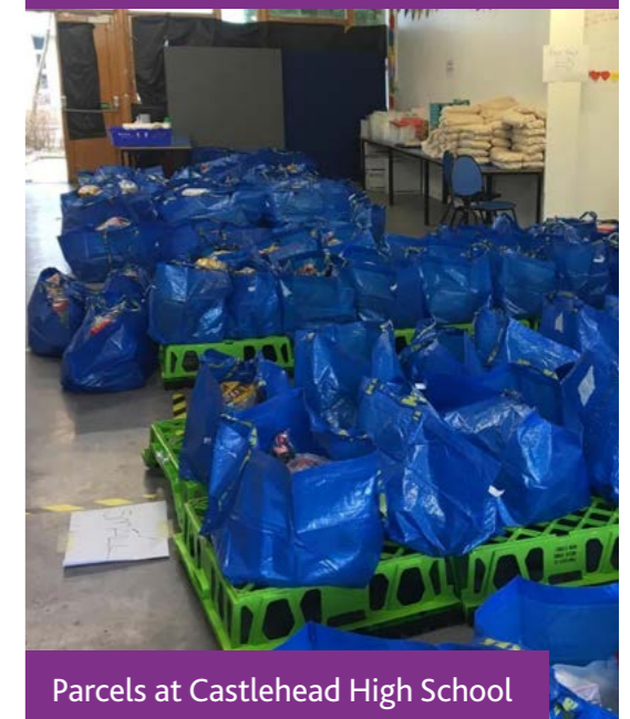
Parcels at Castlehead High School

If you see anyone in your line of work who you think needs assistance, please encourage them to call the helpline on 0300 300 0230 . All referrals are passed to our Local Assistance Team (LAT) who then fully assess the person's needs and welfare. Parcels are then packed and distributed from Castlehead High School and Park Mains High School by frontline staff in Environment and Infrastructure Services.