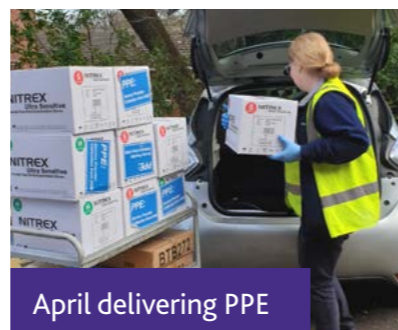
April delivering PPE